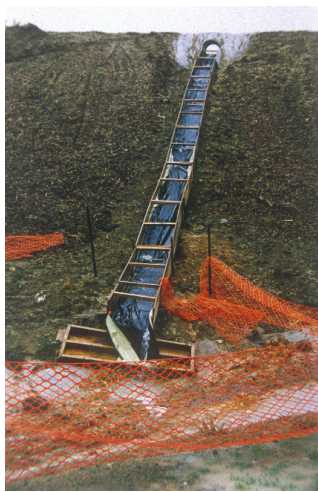
Wooden flume lined with impervious material