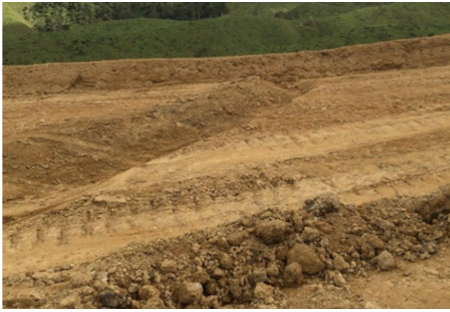
Contour drain